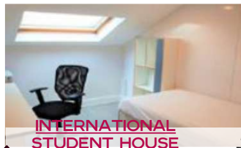
INTERNATIONAL STUDENT HOUSE

Founded by 2 alumni from ESCE Paris. Needl has plenty flatshare options throughout London.